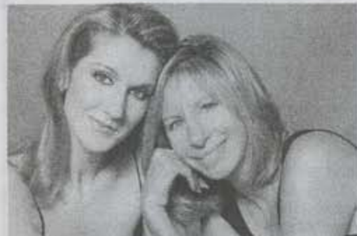
Barbara Streisand's new recording Higher Ground is, well, yucky. Except for superb duet with Celine Dion. Better luck next time!

Another must-see is the new Men's Club called Albury . Located off Sukhumvit 11 (go down Sukhumvit 11 to the end of the soi, turn right, and then immediately left at next soi) this classy facility has inexpensive food, an impressive troupe of massuers, weight-lifting equipment, elegant rooms - you'll have to see for yourself! Albury is open daily 3pm to midnight and there is no entrance fee. Lots of parking in a very private, cosy location. Beautifully done.